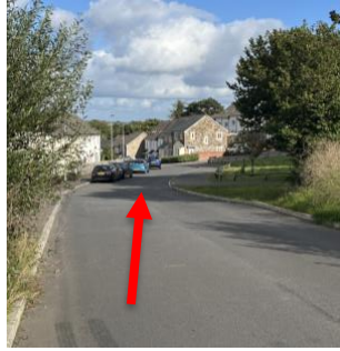
Granite Way Liskeard.