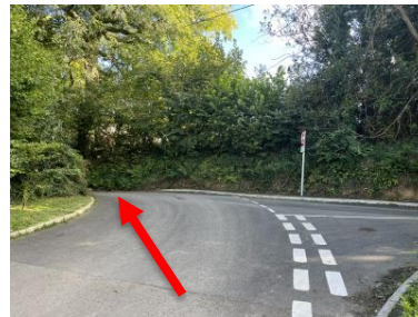
Bear left into Tregay Lane.