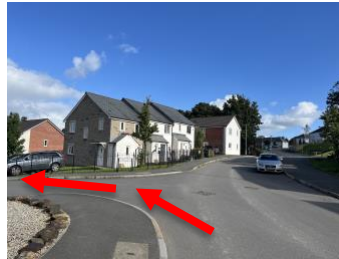
Turn left into Clover Drive.